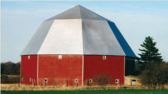
The Hubbard Octagon Barn will be featured on March 11th barn tour

PROMOTING APPRECIATION, PRESERVATION, AND REHABILITATION OF MICHIGAN BARNs, FARMSTEADs, AND RURAL COMMUNITIEs