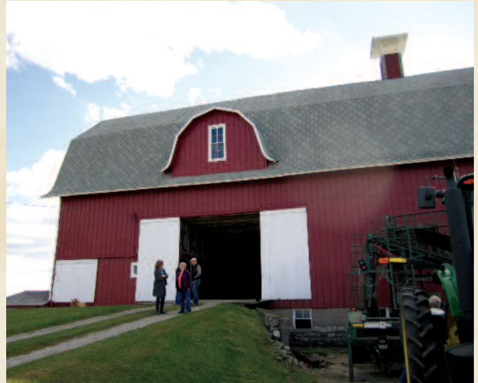
The Hecht barn.