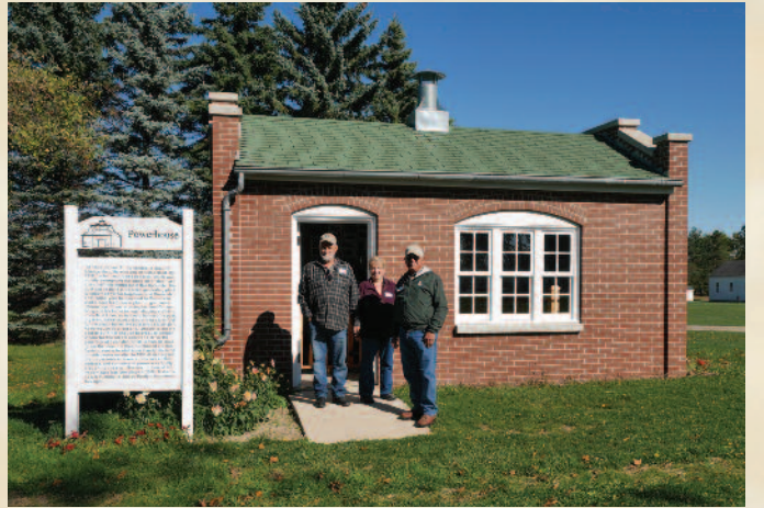
The Octagon Barn Powerhouse.