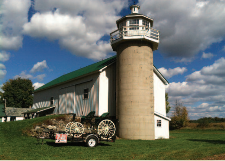
The Sanford barn.