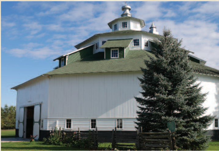
The Octagon Barn in Gagetown, MI.