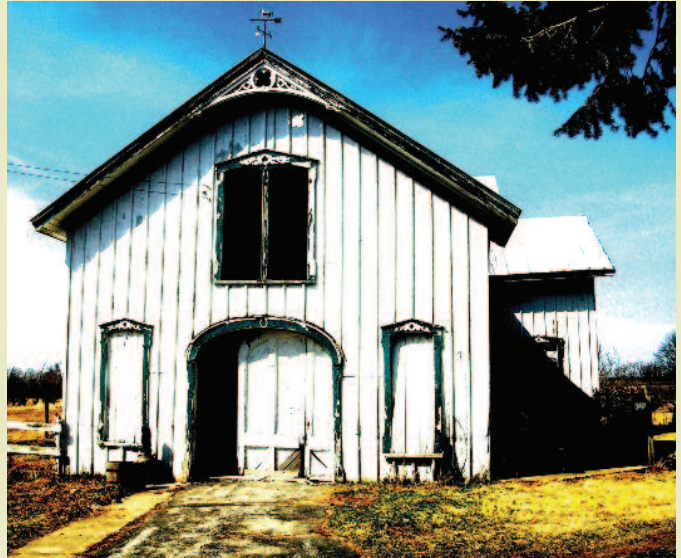
Shank Family barn.

I look at the beams above and try to spot the square markings that someone made almost 150 years ago without the aid of electricity or power tools. How many hours did these individuals spend