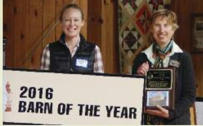
Non-profit Agricultural or Adaptive Use MeadowBrook-North Barn, Rochester, Oakland County, Owner: Oakland University