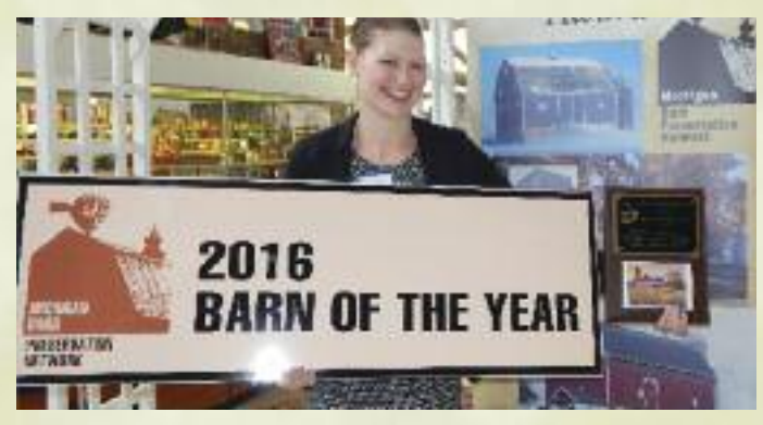
Non-profit Agricultural or Adaptive Use Eastmanville Farm Barn, Coopersville, Michigan, Ottawa County, Owner: Ottawa County

This is the 20th year the network has presented "Barn of the Year" awards. Including this year's awardees, a total of 72 barns from across Michigan have been recognized for their unique qualities and/or preservation efforts.