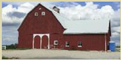
Stahl Event Barn