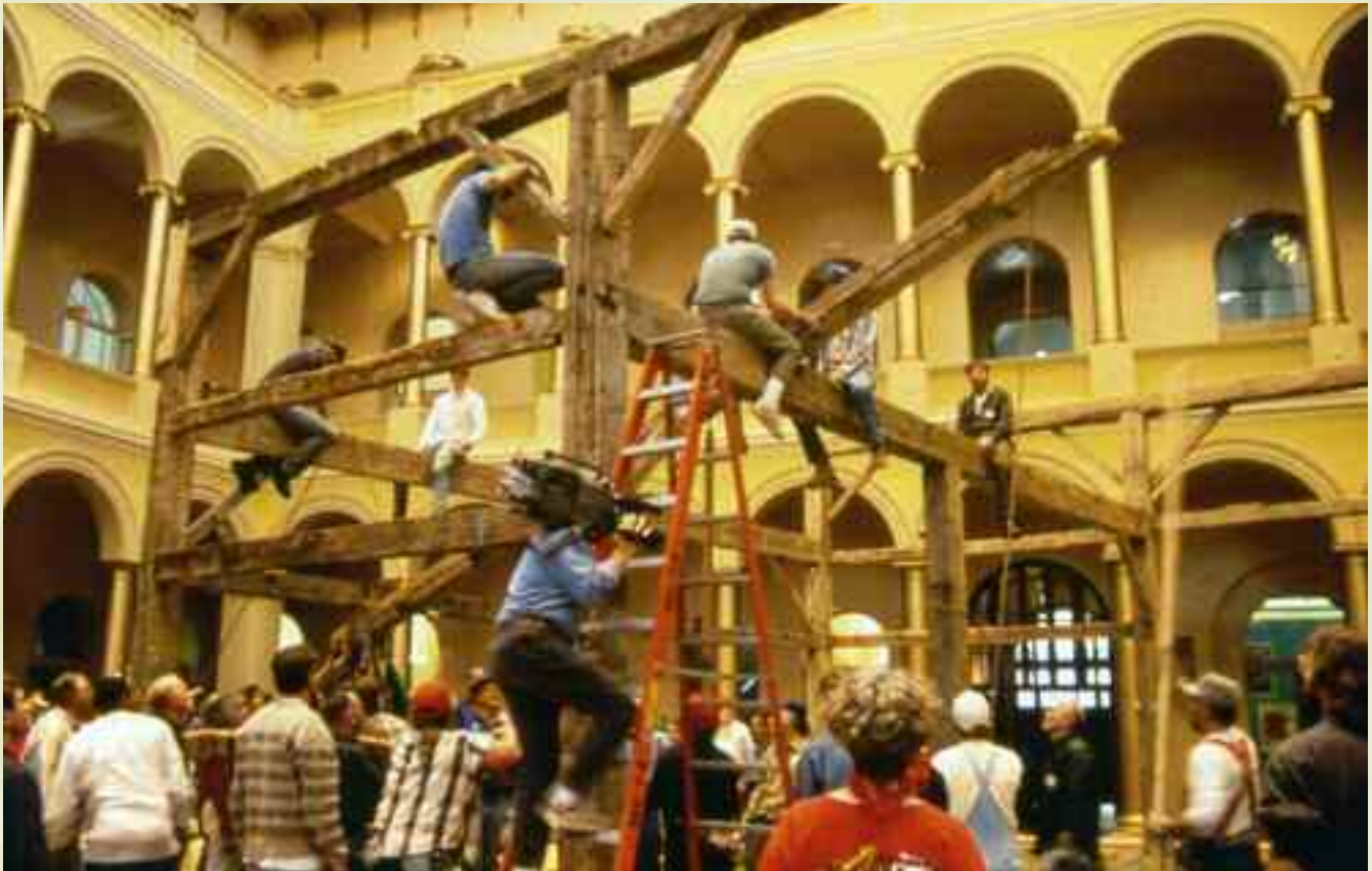
Barn-raising inside the National Building Museum, circa 1984.