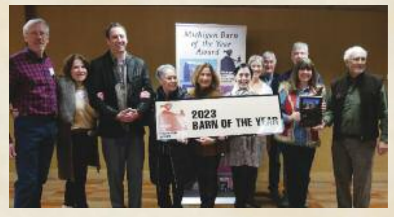
The annual Barn of the Year presentations are always a highlight of the conference