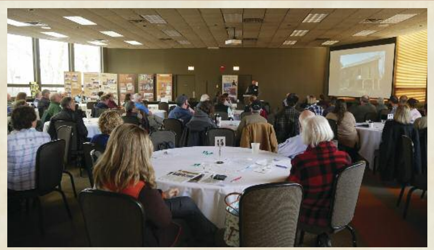
The MBPN Annual Conference—a day filled with informative presentations and camaraderie

PROMOTING APPRECIATION, PRESERVATION, AND REHABILITATION OF MICHIGAN BARNS, FARMSTEADS, AND RURAL COMMUNITIES