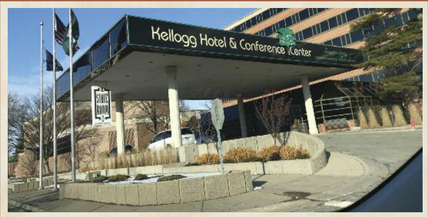
The Kellogg Hotel and Conference Center is once again the site of the MBPN Annual Conference and Member Meeting