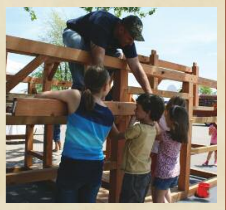
The Network's Teamwork & Timbers model continues to help educate young people about how timber framed barns are constructed.